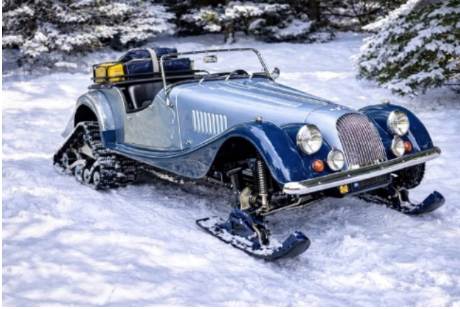
Spotted out and about in Devon over the Winter - there are rumours that Colin & Irene had the car converted so they could get out of the steep approach lanes to their house!!