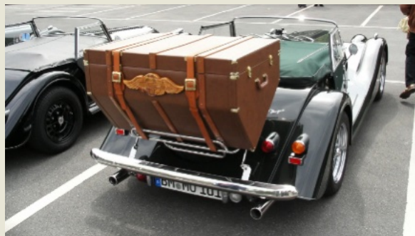
Les Morton - Editor

I know storage space in a Morgan is always at a premium, and more so in the new CX cars, but if you really need to take all those extra clothes and sundry items maybe you should consider a boot extension, as spotted in Germany: