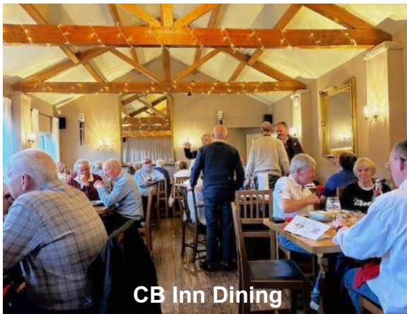
CB Inn Dining

When all of the participants had eaten cake and drunk tea and coffee, we set off on a planned drive of about 19 miles, in a sort of loose convoy, 16 cars to the CB inn, and 14 to the Punch Bowl Hotel (owned by the CB Inn but a few miles distant).