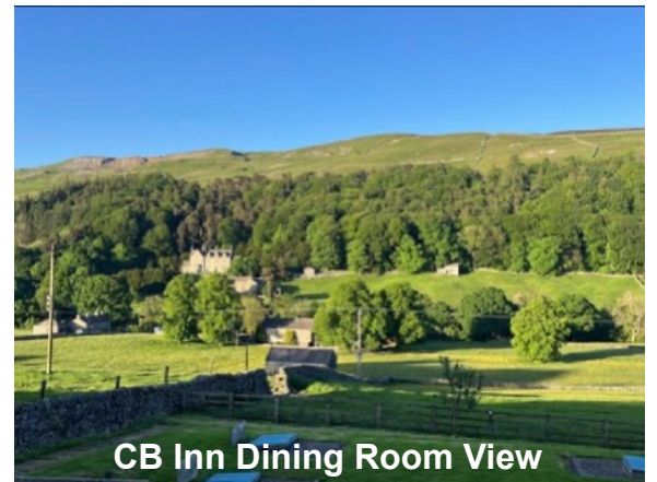
CB Inn Dining Room View

Dinner was served in the CB Inn's function room, which has a wonderful view of the valley, which, as the light evenings grow longer, we could enjoy for most of the meal. However 60 Morganeers in one dining room is not a quiet affair. Quite a lot of centres had come as established