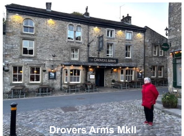
Drovers Arms MkII