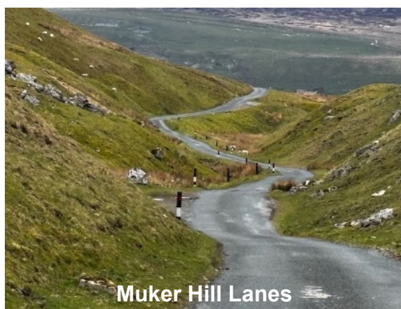
Muker Hill Lanes