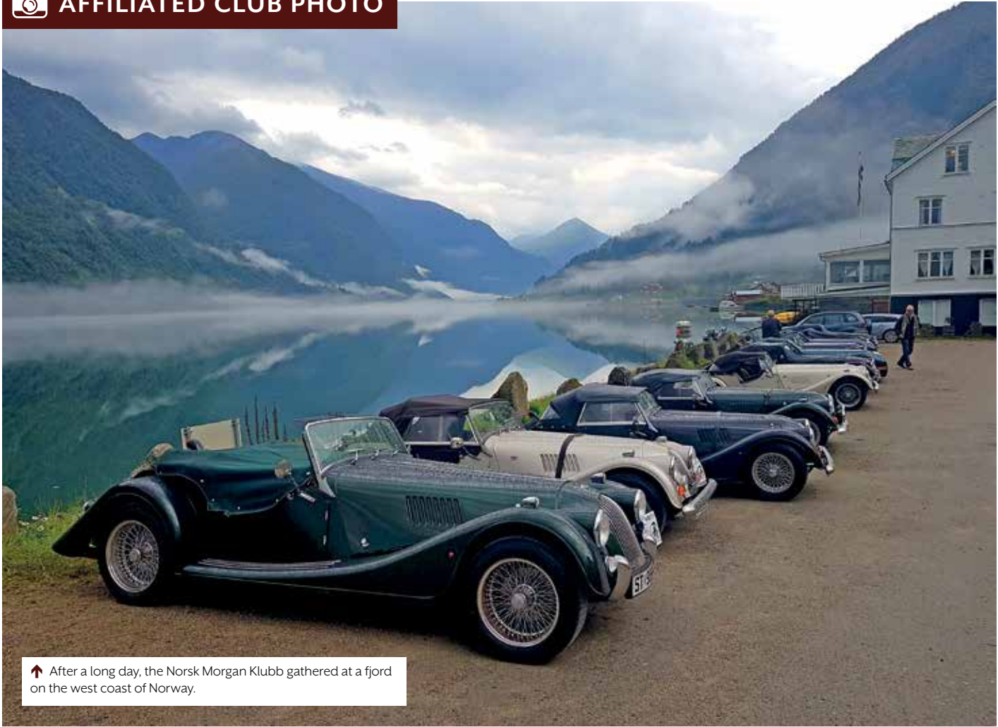
↑ After a long day, the Norsk Morgan Klubb gathered at a fjord on the west coast of Norway.